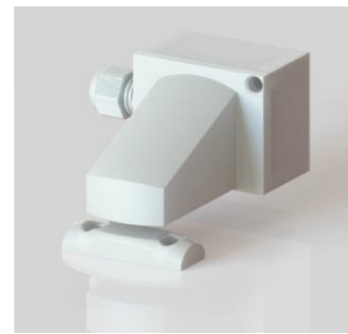
Magnetic door micro-switch